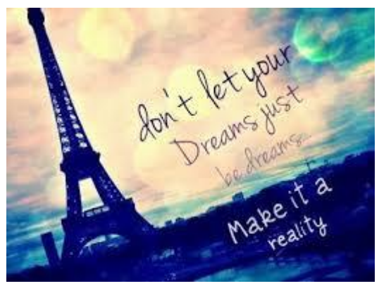
Let me make one thing clear -